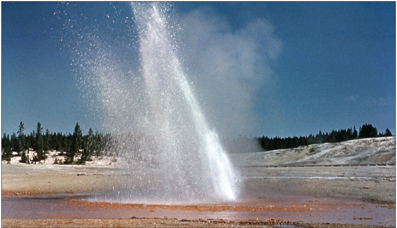
Little Whirligig Geyser