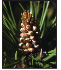
Lodgepole Pine William S Keller 1977

Cracked nine-grain bread topped with sliced roasted turkey, low fat Alpine Lace Swiss cheese, lettuce, tomato and pesto mayonnaise. Choice of side salad, steamed seasonal vegetable, baked beans or French fries 10.95