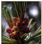
Whitebark Pine Richard Lake 1987