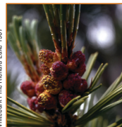
Whitebark Pine Richard Lake 1987

If you have food allergies, please inquire with your server regarding ingredients of menu items Prices do not reflect taxes or a 1.1% utility fee