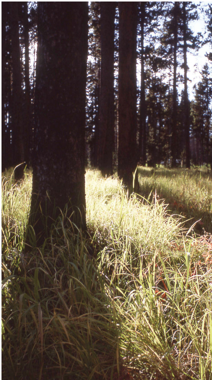
Open Lodgepole Pine