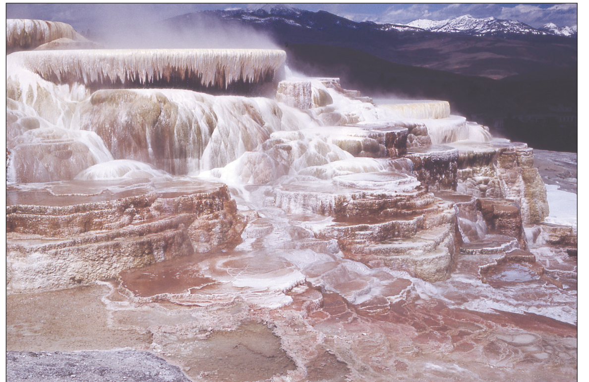
Minerva Springs & Terrace, Mammoth Hot Springs