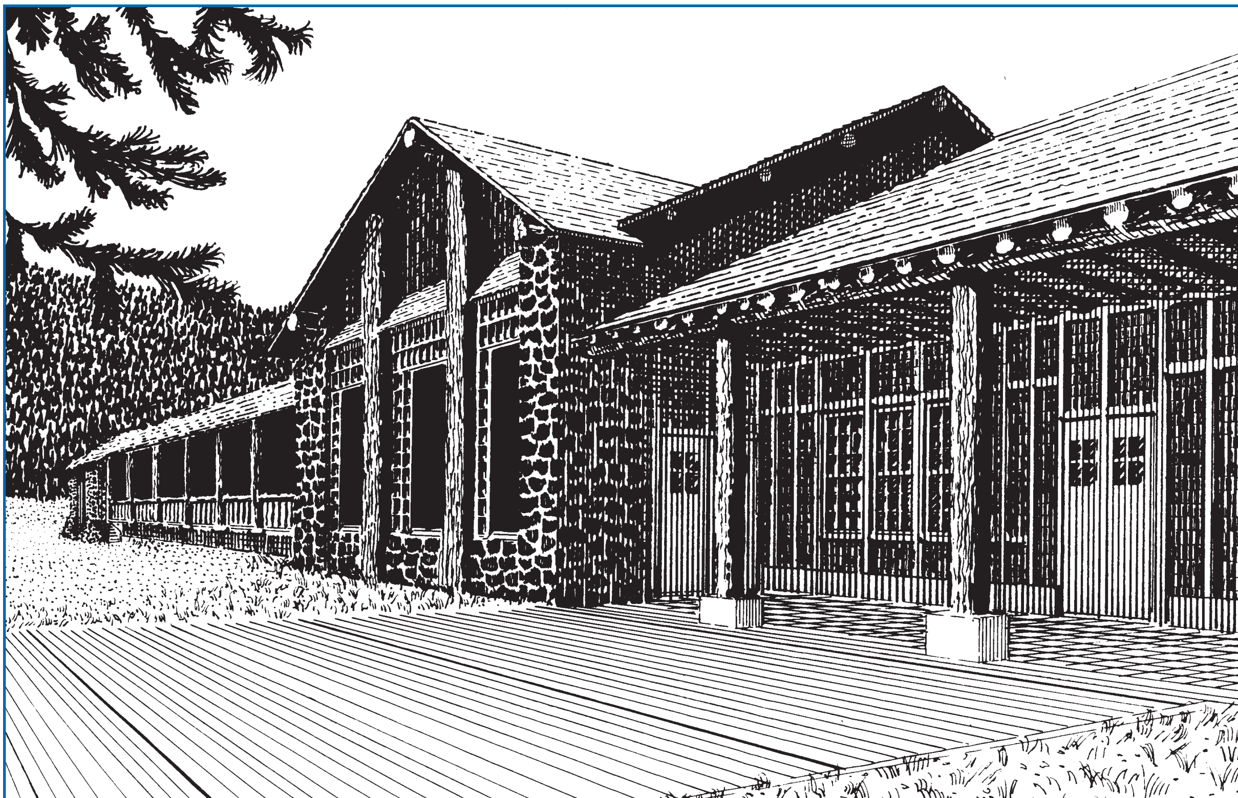
Old Faithful Lodge was designed in 1929 by architect Gilbert Stanley Underwood