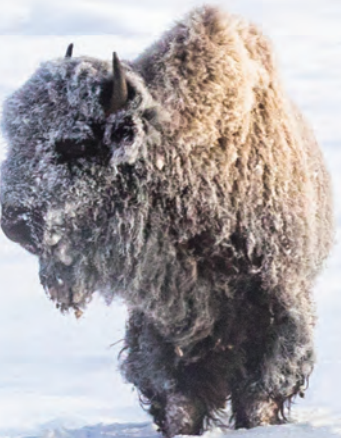
Frost covered bull bison in below zero temperatures.

9 SEE WINTER WONDERS Diamond dust, sundogs, rime ice, frosty waterfalls, ghost trees, hoar frost...winter in Yellowstone means a host of incredible natural phenomena you can't see during the warmer months.