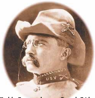
Teddy Roosevelt, as a Rough Rider