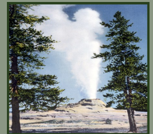
Castle Geyser