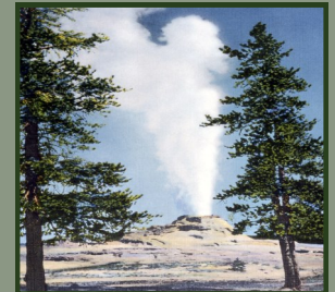
Castle Geyser